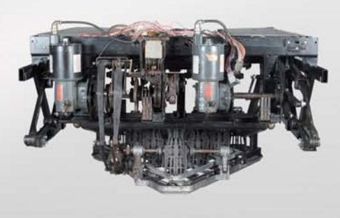
All old wiring and electrical components are completely removed.