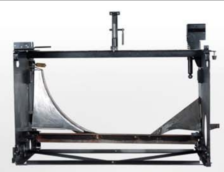
Machines are stripped down to the bear frame so that any metal fatigue can be detected.