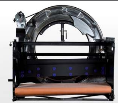
Only Genuine QubicaAMF parts are used in the rebuilding process.