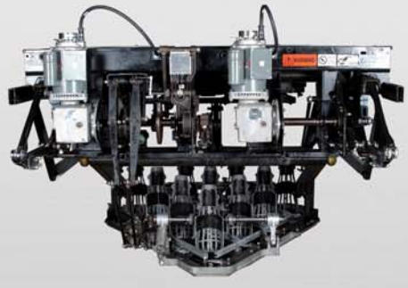
New XLi components, including all new wiring, are installed by our factory trained technicians.