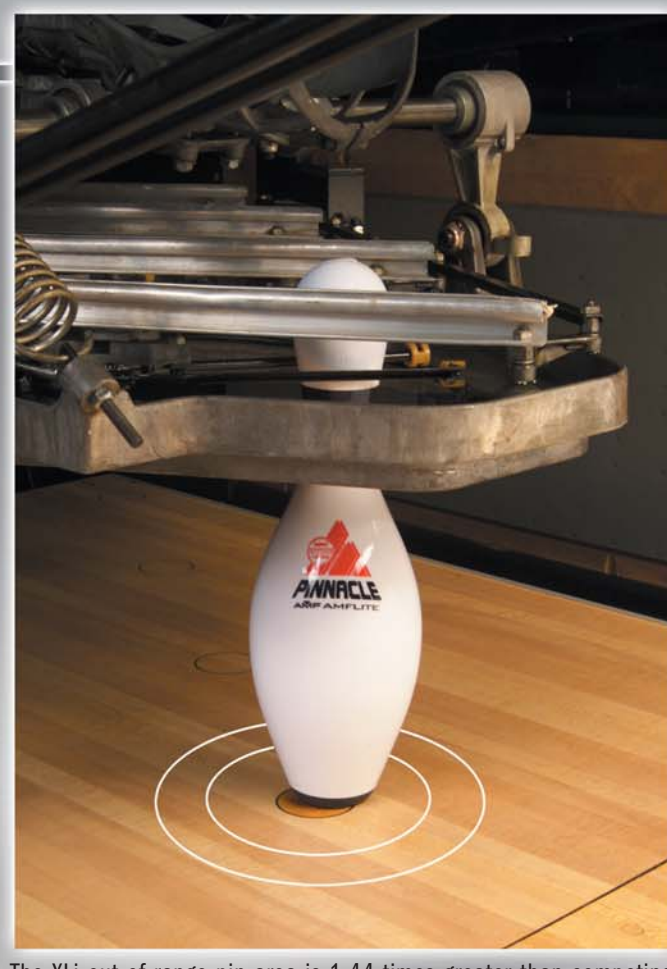
The XLi out of range pin area is 1.44 times greater than competing machines, so manual respots are rare.