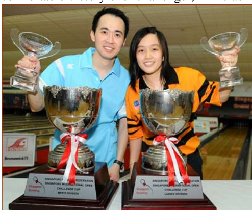
Newly Crowned Champions

UNITED STATES: Thanks to a new association with High Roller, Inc., the Bowlers to Veterans Link (BVL) recently received $2,100.00 from the Military Bowling Championships. High Roller made this donation through a program